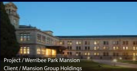
Project / Werribee Park Mansion Client / Mansion Group Holdings