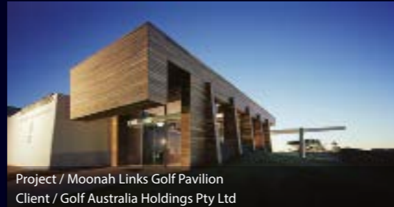
Project / Moonah Links Golf Pavilion Client / Golf Australia Holdings Pty Ltd

Moonah Links Golf Pavilion Broadmeadows Leisure Centre