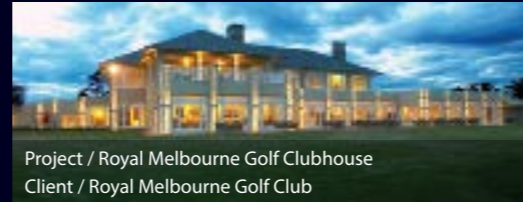
Project / Royal Melbourne Golf Clubhouse Client / Royal Melbourne Golf Club

Buxton Construction commenced its well-recognised involvement with Golf Clubhouses with the construction of Royal Melbourne Golf Clubhouse.