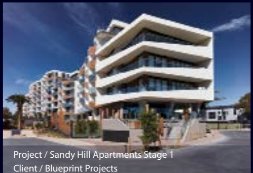
Project / Sandy Hill Apartments Stage 1 Client / Blueprint Projects

Sandy Hill, Stage 1 – The 190 apartment building was awarded an MBA and MBAV Excellence in Construction award.