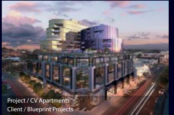
Project / CV Apartments Client / Blueprint Projects

Eastern Golf Club, Buxton's 7 th Clubhouse.