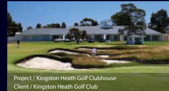
Project / Kingston Heath Golf Clubhouse Client / Kingston Heath Golf Club