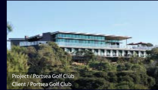
Project / Portsea Golf Club Client / Portsea Golf Club

Buxton Construction completed Geelong Leisurelink Aquatic Centre in Geelong being the fourth aquatic facility.