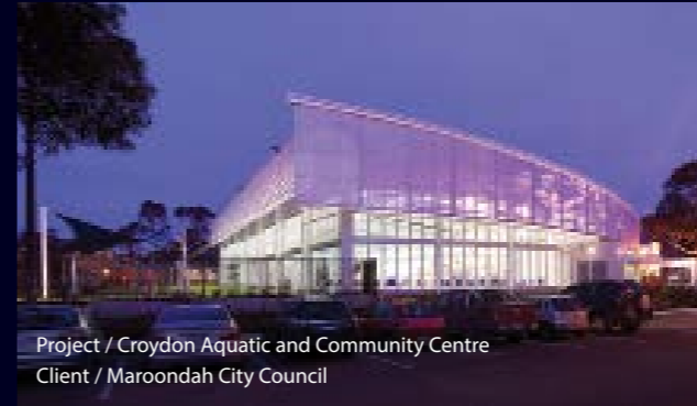
Project / Croydon Aquatic and Community Centre Client / Maroondah City Council

Croydon Aquatic and Community Centre Yering Meadows