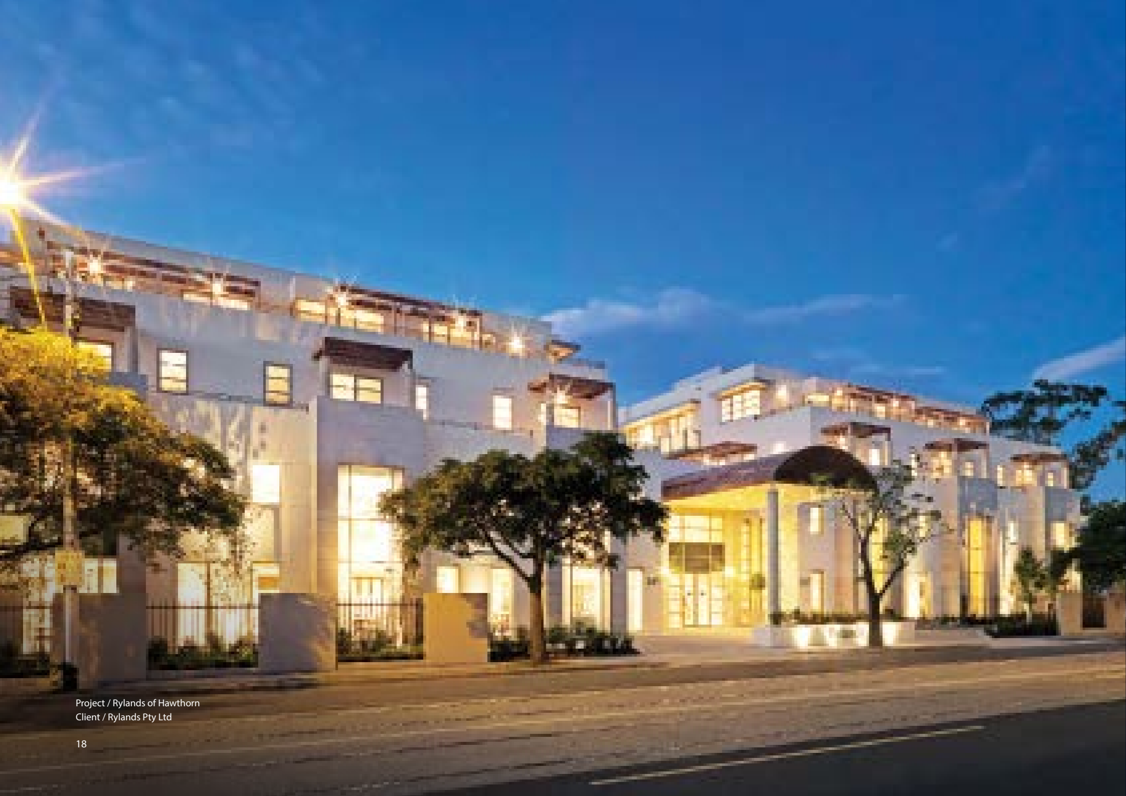
Project / Rylands of Hawthorn Client / Rylands Pty Ltd