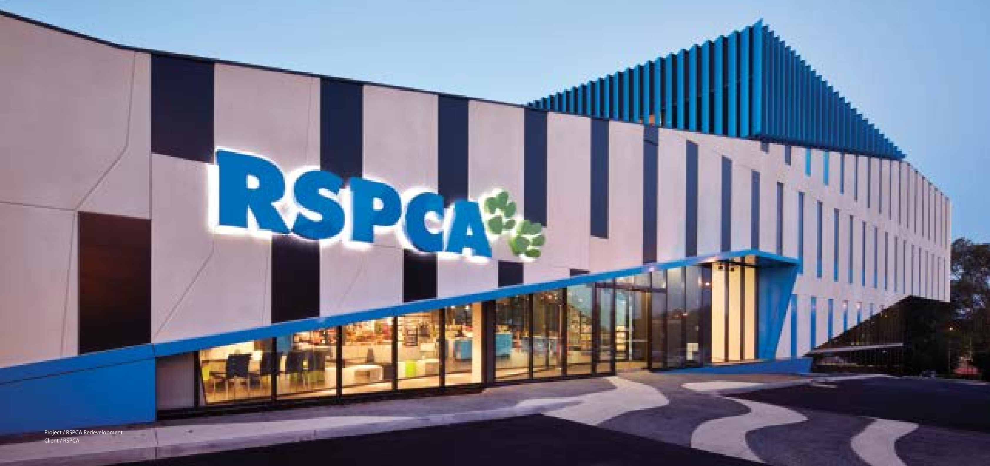
Project / RSPCA Redevelopment Client / RSPCA

"...exceptionally flexible, accommodating and totally committed to delivering a first class product."