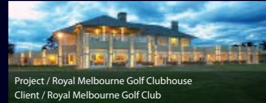
Project / Royal Melbourne Golf Clubhouse Client / Royal Melbourne Golf Club

Buxton Construction commenced its well-recognised involvement with Golf Clubhouses with the construction of Royal Melbourne Golf Clubhouse.