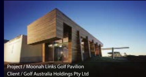
Project / Moonah Links Golf Pavilion Client / Golf Australia Holdings Pty Ltd

Moonah Links Golf Pavilion Broadmeadows Leisure Centre