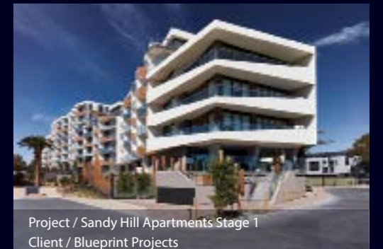
Project / Sandy Hill Apartments Stage 1 Client / Blueprint Projects

Sandy Hill, Stage 1 – The 190 apartment building was awarded an MBA and MBAV Excellence in Construction award.