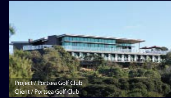
Project / Portsea Golf Club Client / Portsea Golf Club

Buxton Construction completed Geelong Leisurelink Aquatic Centre in Geelong being the fourth aquatic facility.