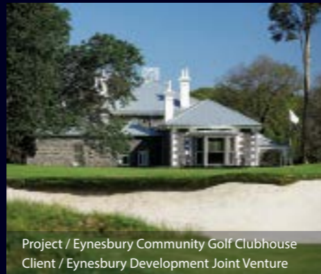
Project / Eynesbury Community Golf Clubhouse Client / Eynesbury Development Joint Venture