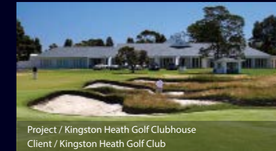
Project / Kingston Heath Golf Clubhouse Client / Kingston Heath Golf Club