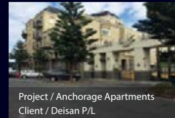
Project / Anchorage Apartments Client / Deisan P/L

Anchorage Apartments was awarded MBAV Best Multi-Unit Development and Best Inner Urban Residential Development.