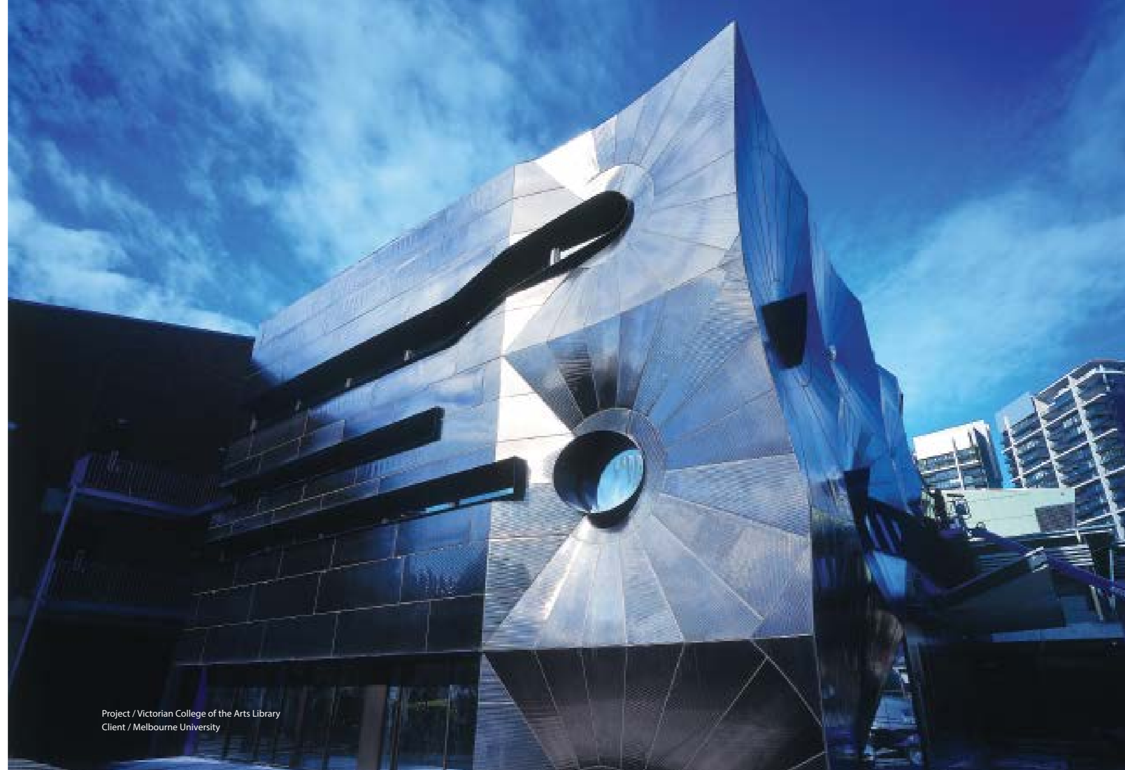
Project / Victorian College of the Arts Library Client / Melbourne University

Buxton Construction has a commitment to deliver environmentally sustainable buildings. We are proud to be members of the Green Building Council of Australia.