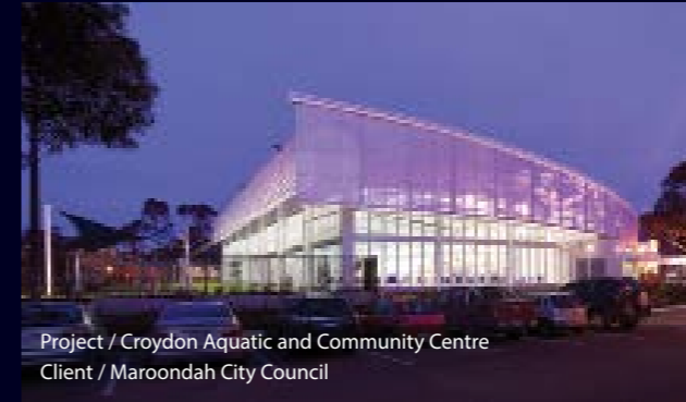
Project / Croydon Aquatic and Community Centre Client / Maroondah City Council

Croydon Aquatic and Community Centre Yering Meadows