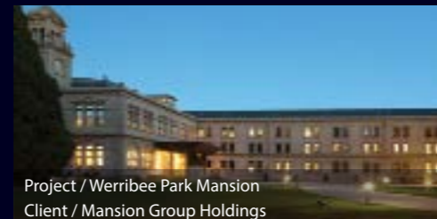
Project / Werribee Park Mansion Client / Mansion Group Holdings