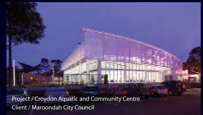
Project / Croydon Aquatic and Community Centre Client / Maroondah City Council