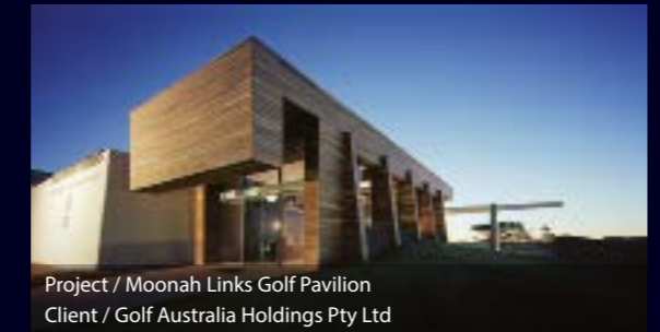
Project / Moonah Links Golf Pavilion Client / Golf Australia Holdings Pty Ltd

Moonah Links Golf Pavilion Broadmeadows Leisure Centre