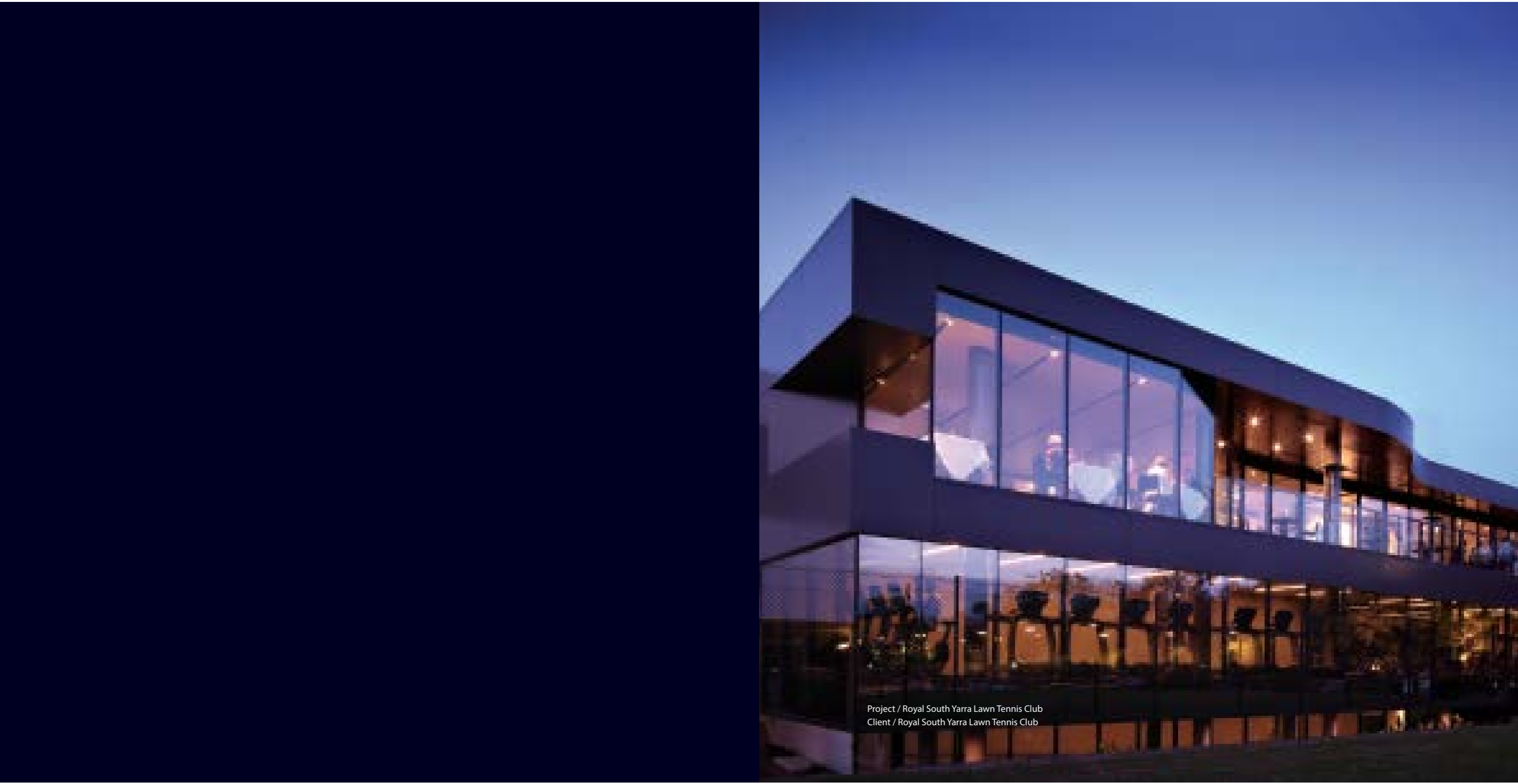
Project / Royal South Yarra Lawn Tennis Club Client / Royal South Yarra Lawn Tennis Club