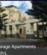
Anchorage Apartments P/L

Anchorage Apartments was awarded MBAV Best Multi-Unit Development and Best Inner Urban Residential Development.