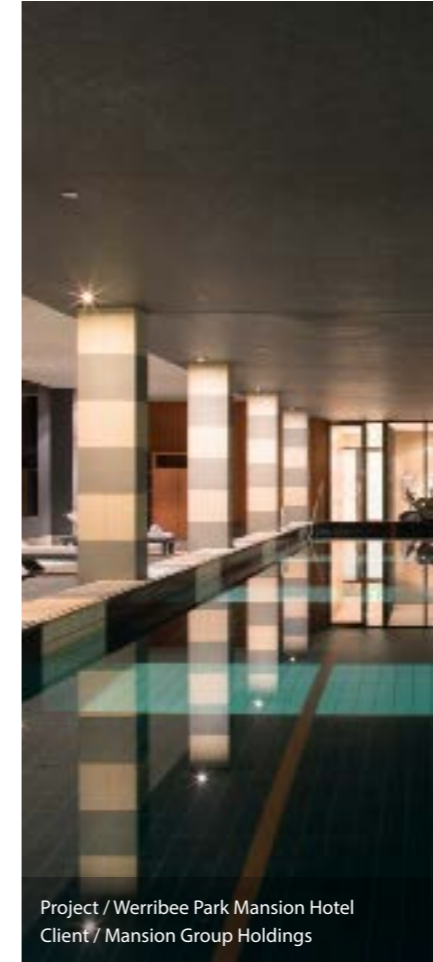
Project / Werribee Park Mansion Hotel Client / Mansion Group Holdings

EDUCATIONAL / Construction of education centres including primary and secondary schools, prestigious universities and colleges, childcare, learning centres and libraries.