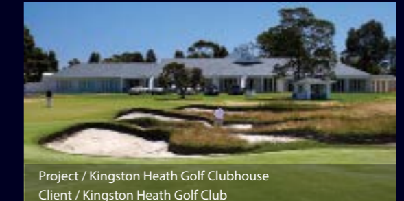
Project / Kingston Heath Golf Clubhouse Client / Kingston Heath Golf Club