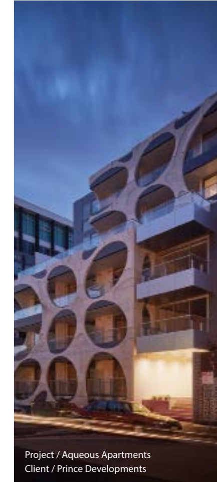
Project / Aqueous Apartments Client / Prince Developments

INDUSTRIAL / Large scale industrial warehouses, bulky goods stores, manufacturing and storage facilities.