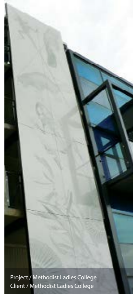
Project / Methodist Ladies College Client / Methodist Ladies College

COMMERCIAL / Commercial buildings and office spaces including refurbishments, extensions and landscaping.