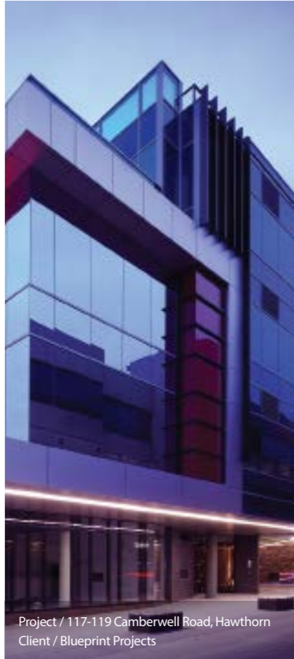
Project / 117-119 Camberwell Road, Hawthorn Client / Blueprint Projects

on across all facets ening our expertise ervices to meet rements.