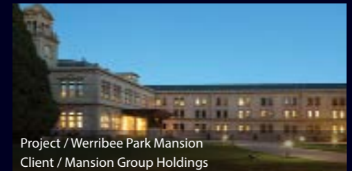
Project / Werribee Park Mansion Client / Mansion Group Holdings

Buxton Construction pitched for the design and construction of Werribee Park Mansion Hotel, which included the conversion of the existing heritage Catholic Seminary Building into 92 hotel rooms. Werribee Park Mansion Hotel was recognised with several State and National awards.