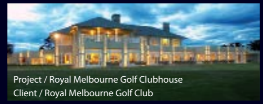
Project / Royal Melbourne Golf Clubhouse Client / Royal Melbourne Golf Club

Buxton Construction commenced its well-recognised involvement with Golf Clubhouses with the construction of Royal Melbourne Golf Clubhouse.