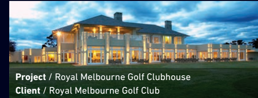
Project / Royal Melbourne Golf Clubhouse Client / Royal Melbourne Golf Club