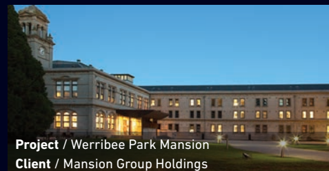
Project / Werribee Park Mansion Client / Mansion Group Holdings

Buxton Construction was appointed as construction manager to convert the existing heritage listed factory into apartments named 'The Anchorage'.