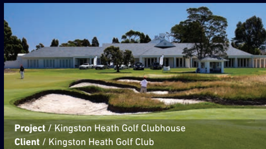
Project / Kingston Heath Golf Clubhouse Client / Kingston Heath Golf Club