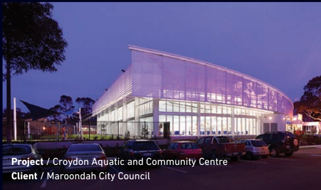
Project / Croydon Aquatic and Community Centre Client / Maroondah City Council