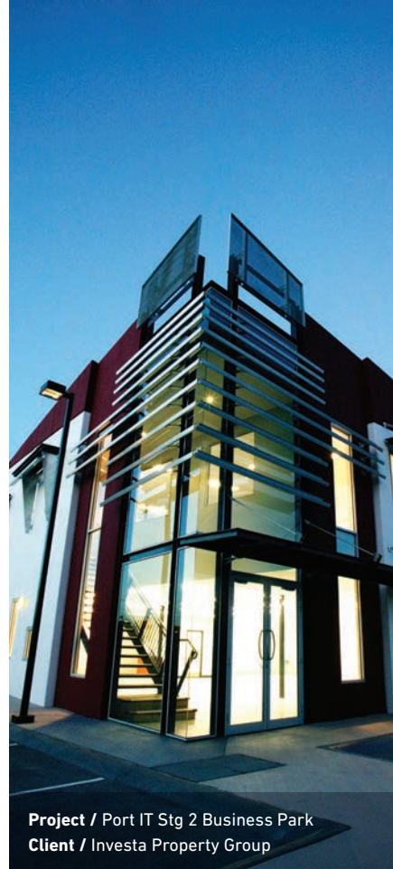
Project / Port IT Stg 2 Business Park Client / Investa Property Group

HOTEL AND LEISURE / Boutique hotels and serviced apartments. Landmark sporting facilities including golf and tennis clubhouses, aquatic and leisure centres.