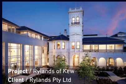
Project / Rylands of Kew Client / Rylands Pty Ltd

Sandy Hill, Stage 1 – The 190 apartment building was awarded an MBA and MBAV Excellence in Construction award.