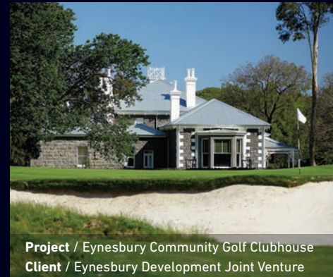
Project / Eynesbury Community Golf Clubhouse Client / Eynesbury Development Joint Venture