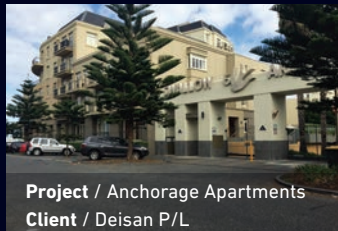
Project / Anchorage Apartments Client / Deisan P/L

Buxton Construction commenced its well-recognised involvement with Golf Clubhouses with the construction of Royal Melbourne Golf Clubhouse.