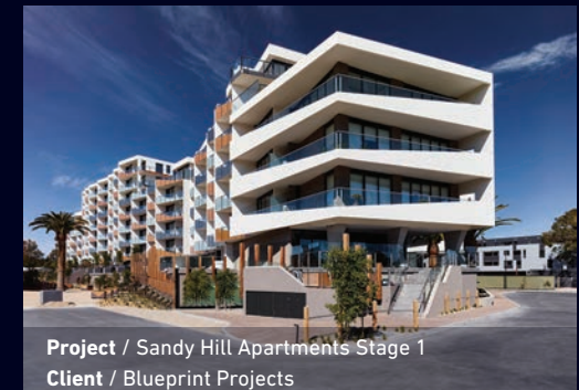
Project / Sandy Hill Apartments Stage 1 Client / Blueprint Projects