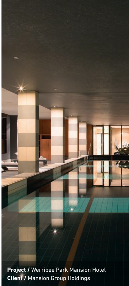
Project / Werribee Park Mansion Hotel Client / Mansion Group Holdings

HOTEL AND LEISURE / Boutique hotels and serviced apartments. Landmark sporting facilities including golf and tennis clubhouses, aquatic and leisure centres.