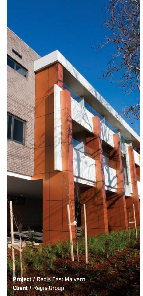
Project / Regis East Malvern Client / Regis Group

RESIDENTIAL / High-end residential projects and high-rise apartment complexes including commercial and retail outlets.