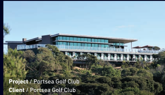
Project / Portsea Golf Club Client / Portsea Golf Club