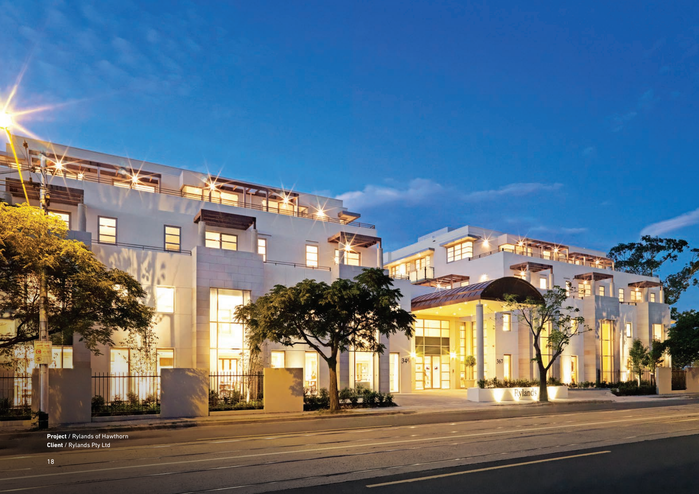
Project / Rylands of Hawthorn Client / Rylands Pty Ltd