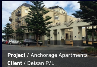
Project / Anchorage Apartments Client / Deisan P/L

Buxton Construction commenced its well-recognised involvement with Golf Clubhouses with the construction of Royal Melbourne Golf Clubhouse.