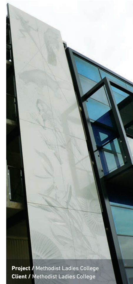
Project / Methodist Ladies College Client / Methodist Ladies College

COMMERCIAL / Commercial buildings and office spaces including refurbishments, extensions and landscaping.