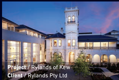
Project / Rylands of Kew Client / Rylands Pty Ltd

Sandy Hill, Stage 1 – The 190 apartment building was awarded an MBA and MBAV Excellence in Construction award.