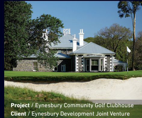
Project / Eynesbury Community Golf Clubhouse Client / Eynesbury Development Joint Venture