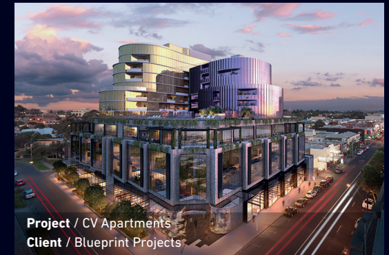
Project / CV Apartments Client / Blueprint Projects