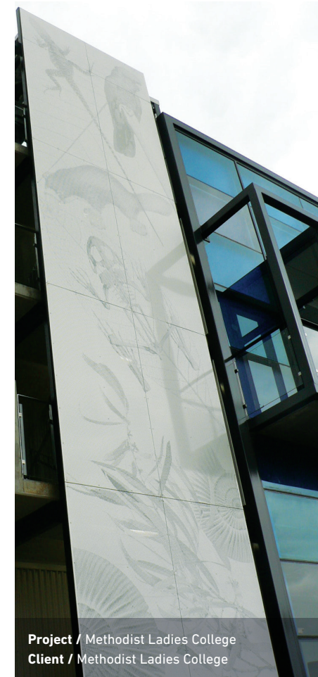
Project / Methodist Ladies College Client / Methodist Ladies College

COMMERCIAL / Commercial buildings and office spaces including refurbishments, extensions and landscaping.