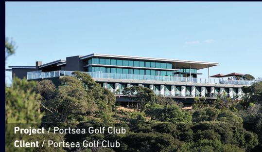
Project / Portsea Golf Club Client / Portsea Golf Club