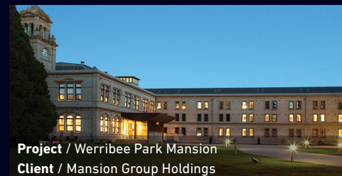
Project / Werribee Park Mansion Client / Mansion Group Holdings

Werribee Park Mansion Hotel was recognised with several State and National awards.