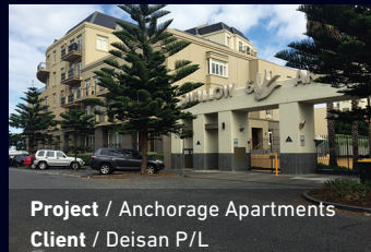
Project / Anchorage Apartments Client / Deisan P/L

Anchorage Apartments was awarded MBAV Best Multi-Unit Development and Best Inner Urban Residential Development.