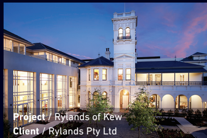
Project / Rylands of Kew Client / Rylands Pty Ltd

Sandy Hill, Stage 1 – The 190 apartment building was awarded an MBA and MBAV Excellence in Construction award.