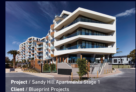
Project / Sandy Hill Apartments Stage 1 Client / Blueprint Projects