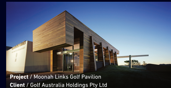
Project / Moonah Links Golf Pavilion Client / Golf Australia Holdings Pty Ltd