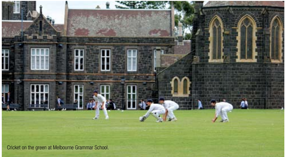
Cricket on the green at Melbourne Grammar School.

Melbourne Grammar has a long tradition of scholastic excellence and