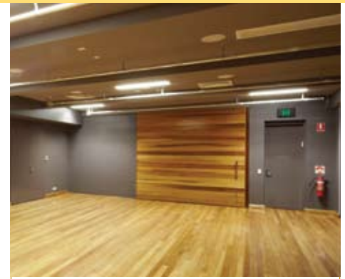
New facility at Beth Rivkah Ladies College.