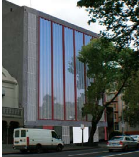
Facade Powercor VM sub-station.

The $1.8 million contract included the installation of a gantry crane for manoeuvring equipment, strengthening the existing structure, stripping and resurfacing the roof, and the installation of new mechanical plant. The building's windows were removed and replaced by block work with a decorative steel panel facade.