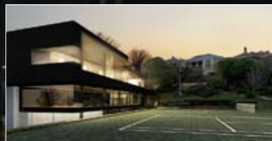
Over and out