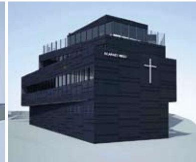
Architect's impressions of new development at St Kevin's College