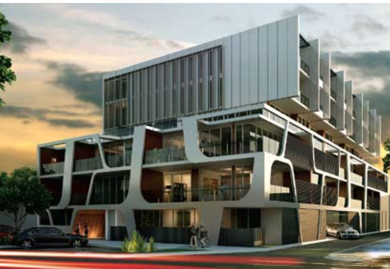
115 Nott Street, Port Melbourne.