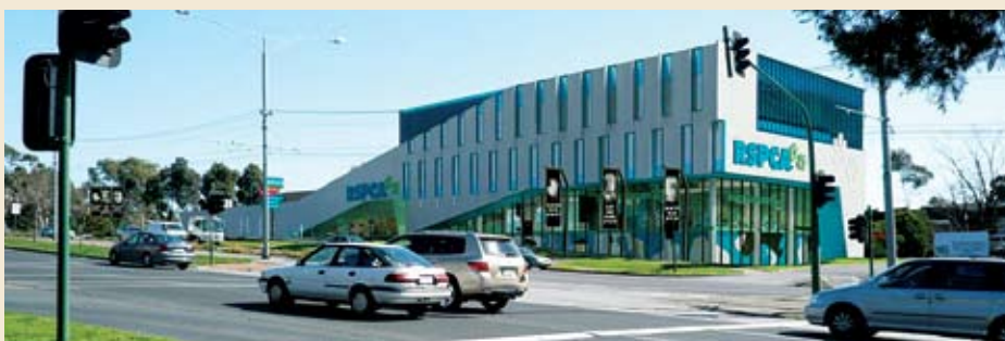
Architect's impression of RSPCA facade.

A four-level extension to the existing animal welfare centre is the major component of an $18.5 million upgrade of facilities at the RSPCA in East Burwood. The extension consists of approximately 1,000 square metres per floor while a large area of the existing centre will be refurbished. Steel-framed with concrete slabs to each level, the facade comprises a combination of high quality pre-cast, timber and metal cladding with large expanses of double-glazing. A section of the roof on the original building will be removed to create an atrium with a featured staircase. The animal welfare centre incorporates specialised animal services such as an adoption centre, vet clinic and hospital, quarantine and wildlife areas, indoor dog training facility and doggy day care centre. It also includes staff amenities and offices, a pet retail outlet, café and public facilities together with a range of specialised animal services. A new entry foyer, designed to be a vibrant, accessible and inviting environment, is a single reception point which provides