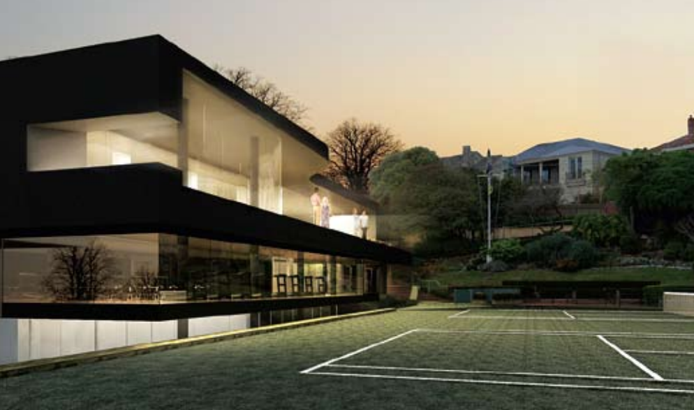
Exterior of clubhouse at Royal South Yarra Lawn Tennis Club.

Conventional pre-cast concrete panels combined with alucobond panels and stone cladding meld with extensive glazing and coloured glass screens to give the building a contemporary, but timeless facade. A timber and stone entrance foyer with double-height void is a feature of the commercial zone while two lifts service offices on all levels. Earlier this year Buxton handed over the first stage which consisted of 41 apartments, with two penthouses subsequently added to the scope.