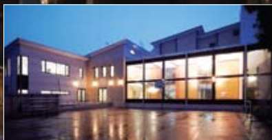
An outstanding academic record