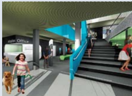
Architect's impression of new RSPCA facility.

Project manager for Buxton Construction's RSPCA project, Sweett Group, operated under the names of Padgham Sweett and BurnsBridge Sweett until being re-branded on 1 July this year. The two entities have been part of the Cyril Sweett Group since 2008 and 2009 respectively.