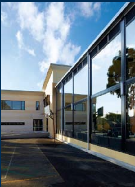
Beth Rivkah Ladies College.

Founded in 1956 with only a handful of students in an era when deportment and music ranked alongside academic and religious studies, Beth Rivkah Ladies College in East St Kilda has developed into one of Australia's leading Jewish schools with classes from kindergarten to Year 12. The college's objective is to enrich the community with young graduates who have an exceptionally well-rounded education.