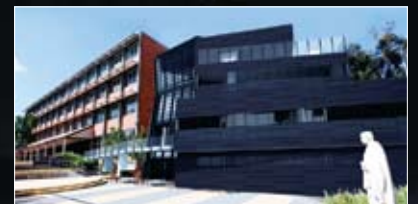
The challenges at St Kevin's College