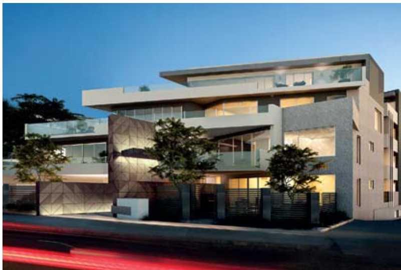
40 Harold Street, Hawthorn.